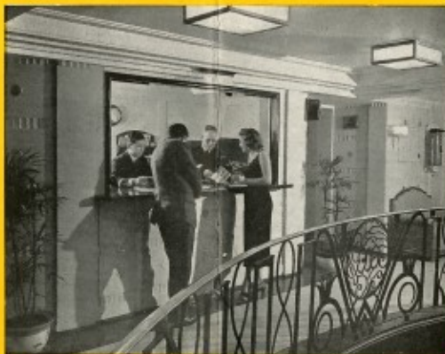
Enquiry Office (Promenade Deck A)