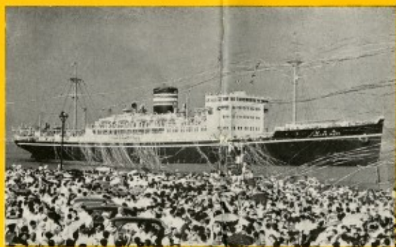
m.s. Hikawa Maru leaving Port of Yokohama