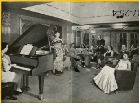
Comfortably and elegantly appointed Cabin Class Lounge (Promenade Deck A)