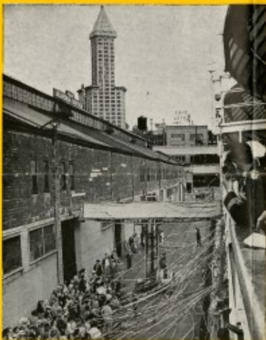
m.s. Hikawa Maru at Port of Seattle