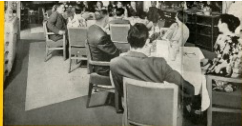
The delightfully appointed Cabin Class Restaurant (8 Deck)