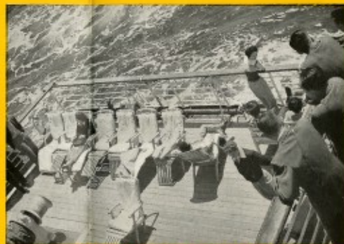
Enjoying sea breeze and sunshine on B Deck