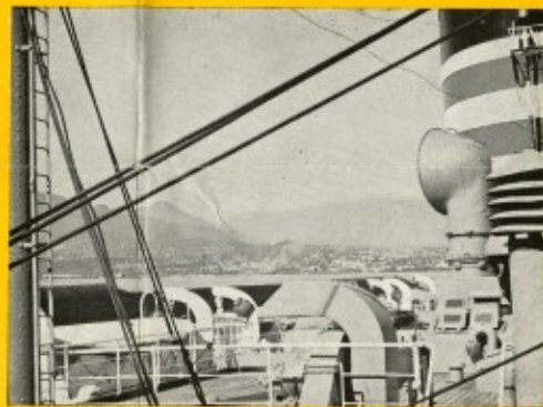
m.s. Hikawa Maru entering Port of Vancouver