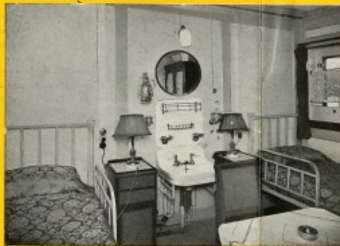
Typical Cabin Class two berth Stateroom with bath