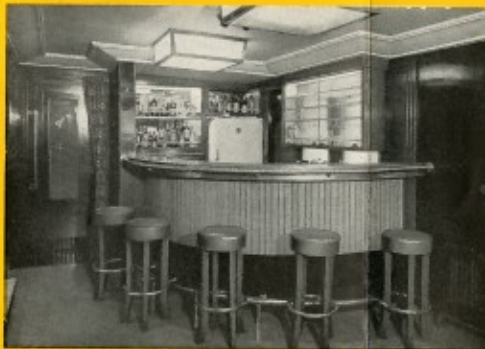
Cocktail Bar conveniently situated in the corner of the Cabin Class Smoking Room (Promenade Deck A)