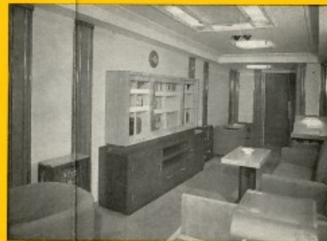
Quiet and comfortable Cabin Class Library (Promenade Deck A)