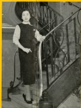
The Main Staircase leading from A to B Deck where the Children's Nursery and Cabin Class Restaurant are located