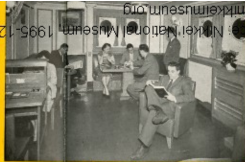
Comfortable Third Class A Lounge (8 Deck)