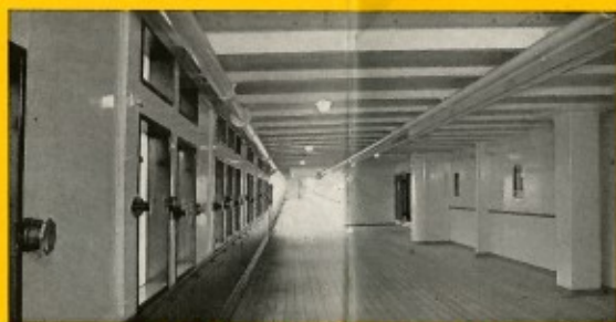
The glass enclosed spacious Promenade Deck A