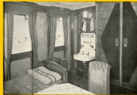
Majestically appointed Cabin Class Stateroom (Promenade Deck A)