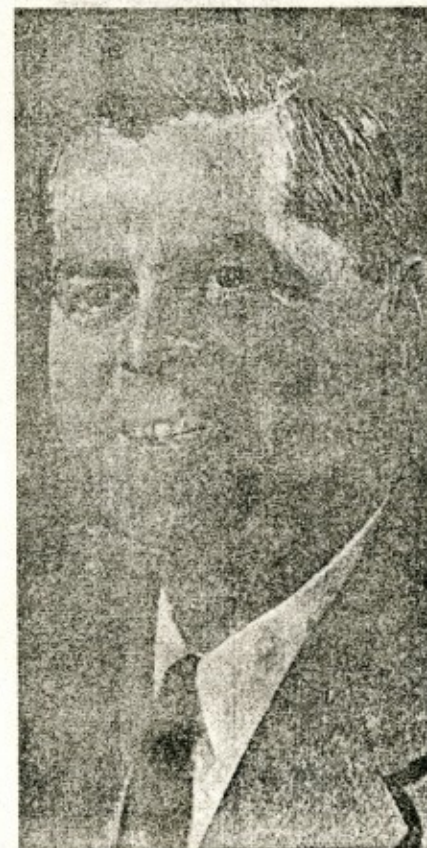
HONOURABLE WILLIAM ANDREW CECIL BENNETT