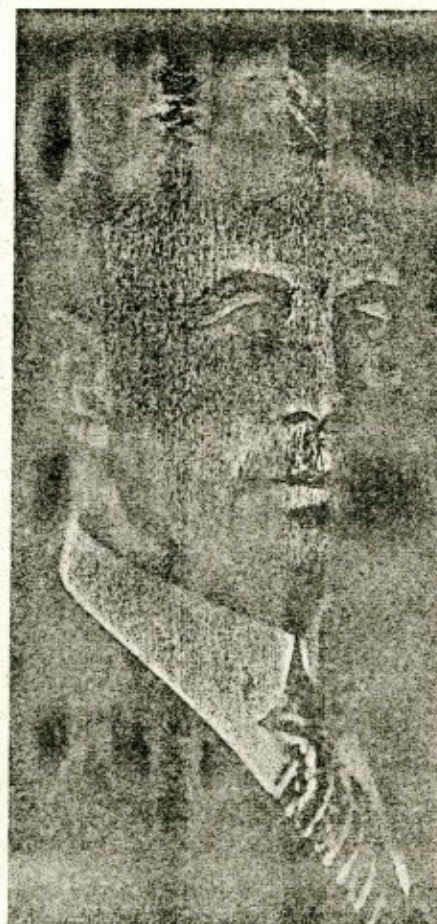
HON. T. A. CRRERAR