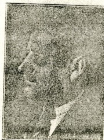
CAPT. RT. HON. IAN ALISTAIR MACKENZIE, K.C., M.A., LL.B.