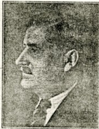
CAPTAIN HON. IAN ALISTAIR MACKENZIE, K.C., M.P.

MACKENZIE, Captain Hon. Ian Alistair, K.C., M.P. — Minister of Veterans' Affairs, Ottawa, Ont. Born Assynt, Sutherland Co., Scotland, July 27, 1890, son of George and Anne (McRae) Mackenzie, Assynt, Scotland. Educated: Kingussie (a famous Highland School), and Edinburgh University (M.A., 1911); Honors in Classics, 1912; LL.B. with highest distinction, 1914. At thirteen years of age went to Kingussie School and in third year was gold medalist and first in qualifying Scholarship in Northern Scotland; matricu-