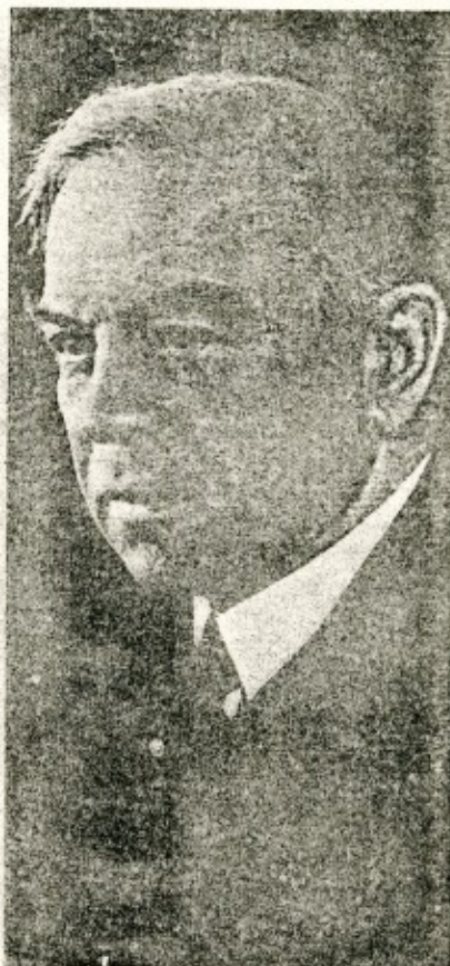
RIGHT HON. WILLIAM LYON MACKENZIE KING, P.C., (Imp.) 1922; P.C. (Can.) 1909; C.M.G., 1906; M.P.