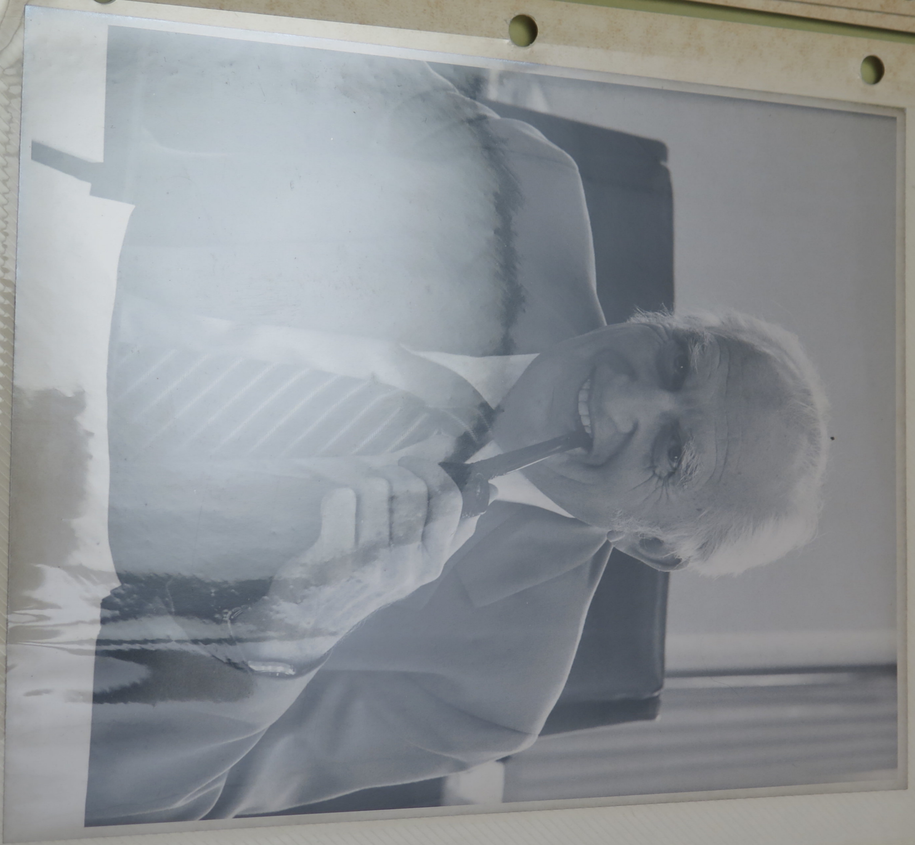
McPherson Family Scrapbook