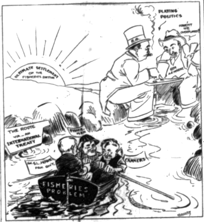
Now if that obstruction could be removed