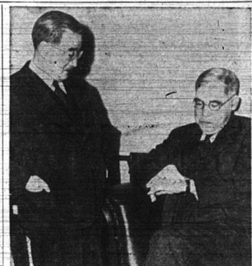
CHECKING ZERO HOUR? - Japan's special envoy, Saburo Kurosawa, right, looks at his watch at the time Japanese bombers were attacking Pearl Harbor, Hawaii. He is pictured with Japanese Ambassador Nomura, as they awaited conference with Secretary of State Hull.

HONGKONG (CP)—Some Japanese penetration of Hongkong's defenses was acknowledged in a communique today, but it declared the attack had been halted even though fighting continues.