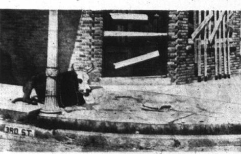
FOUND WANDERING in a fire and explosion-wrecked downtown section of Texas City, Texas, this cow was tied to a lamp post, where she lazily chewed her cud while waiting for her owner to pick her up.